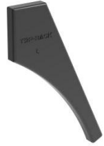
Skirt Cap -L 1040108

Provides a complete finish to the installation, preventing safety hazards at the end of the skirt.