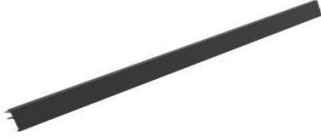
Skirt -7.54ft/2300mm A197-2300

Customizable length options, easy assembly, compatible with any thickness of solar module, and aesthetically pleasing.