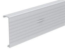
Skirt Connector 3010405

Splice connection for the skirt, made from high-quality aluminum.