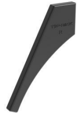
Skirt Cap -R 1040109

Provides a complete finish to the installation, preventing safety hazards at the end of the skirt.