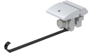
Hidden End Clamp 3010138

Secures modules to rail ends with a fully hidden bond, with no restrictions on module size or thickness.