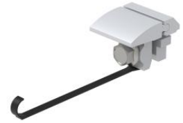
Hidden End Clamp 3010138

Securely bonds modules to rail ends, entirely hidden, No restrictions on module size and thickness