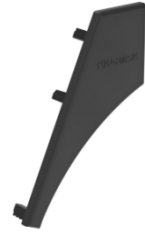
Skirt Cap 1040108

Provide a complete finish to the installation work, Avoid safety hazards at the end of the skirt.