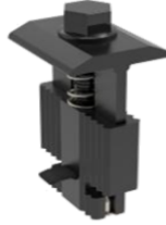
Mid Clamp 3010355

Black surface treatment, fits modules from 30~40mm thick, with Grounding device