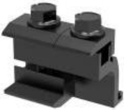
Skirt clip 3010363

Provide a complete finish to the installation work, Avoid safety hazards at the end of the skirt.