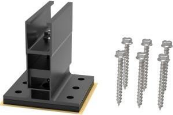
Rail-less Base 3010354

Aluminum 6005-T5 made with Black Anodized. Installation height adjusted, Double butyl glue.