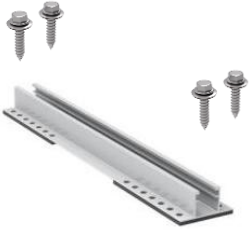
Mini Rail A116

Trapezoidal metal sheet tile, customized length, portrait panel array ST5.5*25 thin sheet bolts, EPDM pad