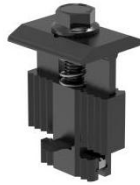
Mid Clamp 3010355

Black surface treatment, fits modules from 30~40mm thick, with grounding device