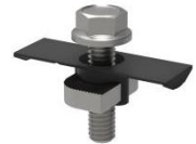
Micro Inverter Racking 3010167

Rail-less based system micro inverter fastener, SS304 made